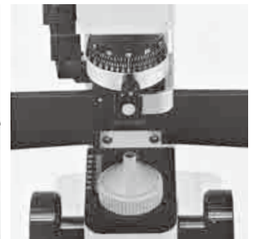
Measurement of Contact Lens

Design and specifications are subject to change without notice.